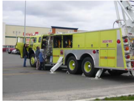
Fire Safety Day – Canadian Tire